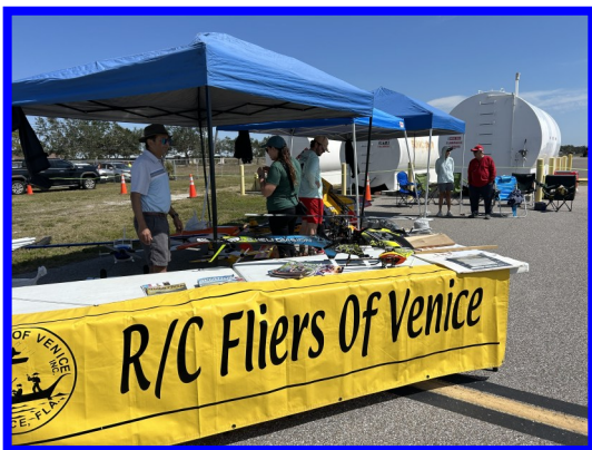
R/C Fliers of Venice Display at Venice Airport Last Year