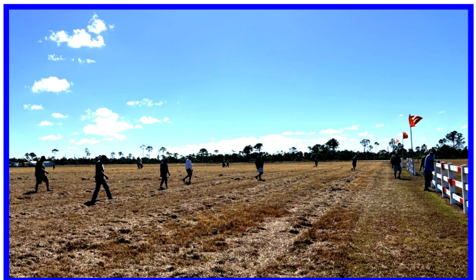
Field Sweep Looking for LiPo Batteries and Other Debris